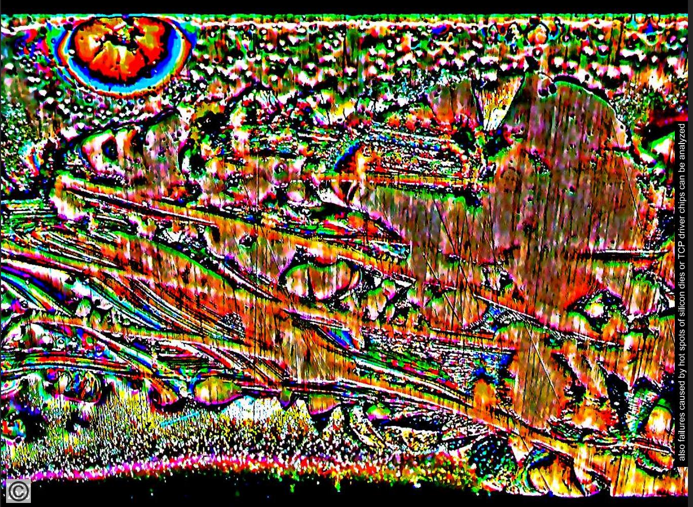
also failures caused by hot spots of silicon dies or TCP driver chips can be analyzed